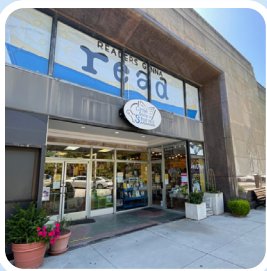
Little Shop of Stories 133 E. Court Square littleshopofstories.com