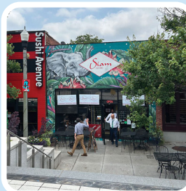
Siam Thai 123 Sycamore St. siamthaidecatur.com