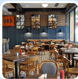
Folk Art 174 W. Ponce de Leon Ave. folkartrestaurant.com