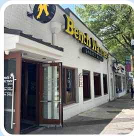
Bench Warmers Sports Grill 240 W. Ponce de Leon Ave. benchwarmersgrill.com