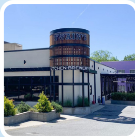
Twain's Brewpub & Billards 211 E. Trinity Pl. twains.net