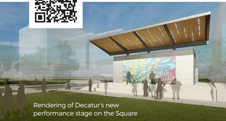
Rendering of Decatur's new performance stage on the Square