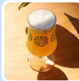
Inner Voice Brewing 308 W. Ponce de Leon Ave. innvoicebrewing.beer