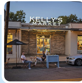
Kelly's Market 308 E. Howard Ave. kellys.market