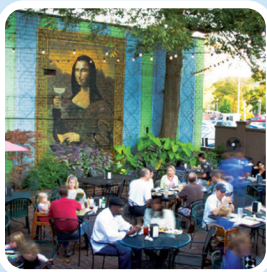
Raging Burrito 141 Sycamore St. ragingburrito.com