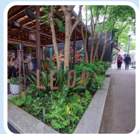
Leon's Full Service 131 E. Ponce de Leon Ave. leonsfullservice.com