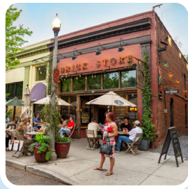
Brick Store Pub 125 East Court Sq. brickstorepub.com