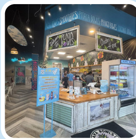
Playa Bowls 335 W. Ponce de Leon Ave. playabowls.com