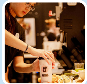
Rebel Teahouse 225 E. Ponce de Leon Ave. rebelteahouse.com