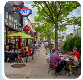
Sushi Avenue (two locations) 308 W. Ponce de Leon Ave. and 131 Sycamore St. sushiavenuedecatur.com