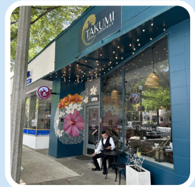
Takumi Cuisine 250 W. Ponce de Leon Ave. takumicuisine.com