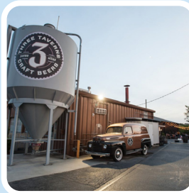
Three Taverns Brewery 121 New St. threetavernsbrewery.com