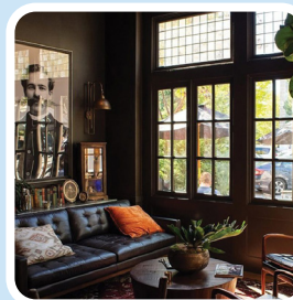
The Ramspeck 127 E Court Sq. theramspeck.com