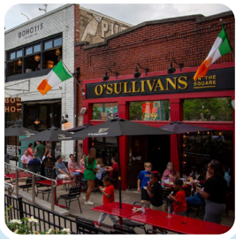
O'Sullivan's 111 Sycamore St. osullivanspub.com