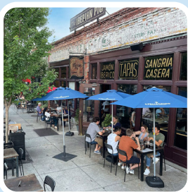
Iberian Pig 121 Sycamore St. iberianpig.com/decatur