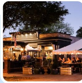
The Marlay House 426 W. Ponce de Leon Ave. themarlayhouse.com